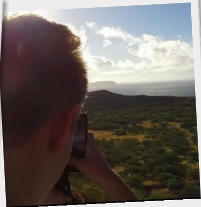
Expand your horizons