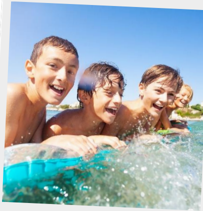
Creating lifelong friendships